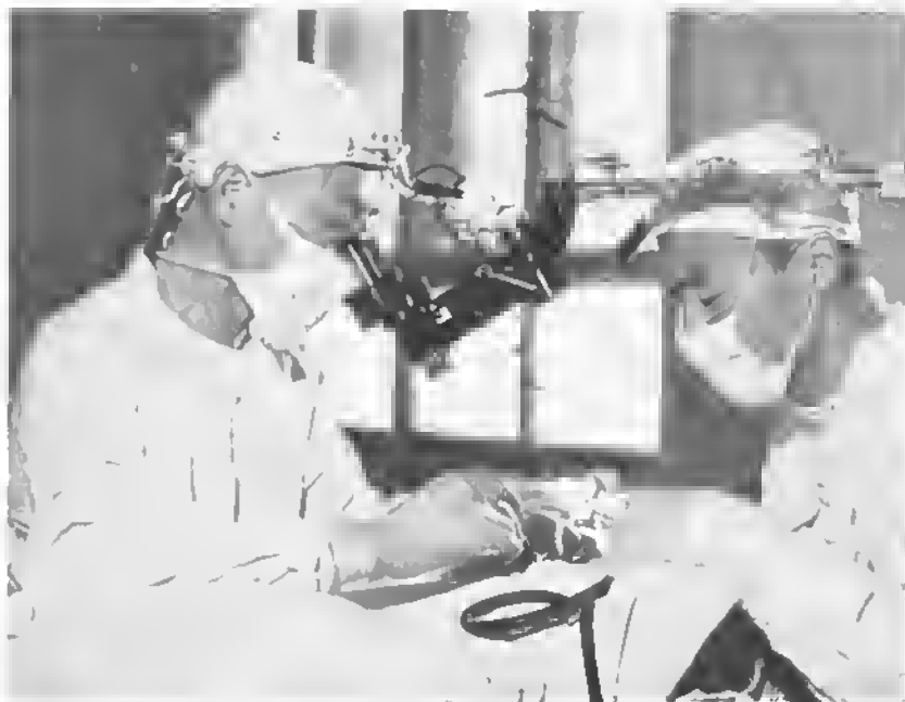
An operation to improve hearing.

It was true, the line I had carried out in scientific research was exactly the stuff lauded by Liu Shao-chi. I had abandoned the study on prevention and treatment of otitis and other common illnesses of labouring people to study only diseases rare in our country such as otosclerosis — my aim being to get a name and material reward with a single success. I had turned away many deaf-mutes, for example, and instead concentrated most of the personnel, money and materials on finding a way to use acupuncture treatment for deaf-mutes by applying the electrophysiological method on guinea pigs. In order